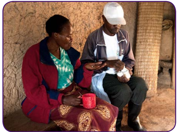
Figure 1: A CHW provides directly observed therapy to a patient in Rwanda

Your program may be a source of health education and prevention rather than diagnosis or referral. Whatever you choose, it is important to ensure that you are able to support CHWs financially and with adequate supervision and training. Determine the geographic scope of the intervention by identifying key communities that will receive the support of the CHW program, and establishing the ratio of CHWs to population served. This will likely vary from country to country, especially given different rural population densities across