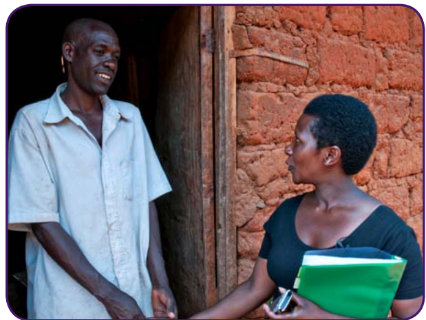
Figure 11: A community health worker in Rwanda checks in on a former TB patient, to whom she delivered medication every day for a year

While the ratio of CHWs to community members will vary across countries and projects, it is important to ensure that no CHWs are overburdened such that they cannot fulfill their responsibilities. Understanding the physical topography as well as the scope of CHW interventions will help you decide on an appropriate ratio. Some factors to consider include: the distance CHWs must travel from one household to another; available transportation; safety of patients' neighborhoods after dark; and CHWs' other responsibilities and/or necessary income-generating activities.