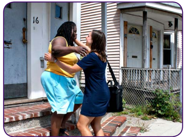
Figure 4: A community health promoter (right) at PACT in Boston greets a patient outside of her house