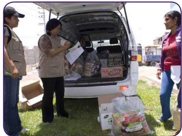
Figure 3: Community health workers prepare to hand out monthly food baskets to patients at Socios En Salud in Peru

you are working in several districts in one country and the health problems are consistent across districts, CHWs in each district should receive training sessions that contain the same information that clearly reflects what tasks they are expected to do as a result of the training. However, if the needs vary by district, then the specific training may need to be revised or augmented with additional information. In 2010, for example, in Burera, a district in Rwanda with a high prevalence of respiratory disease, providing training on that subject was a programmatic priority. But in the Eastern province, which does not have such high rates of respiratory disease, we trained on the topic of malnutrition. It is important to make such decisions in consultation with the MOH at the local and district levels and ensure that the content of the trainings is aligned with national protocols. A standardized curriculum offers both a systematic approach to training and also provides an opportunity for measuring results of a CHW program. Funders may want to see the overall effectiveness of a CHW program—or training session—and a standardized curriculum that includes pre-test and post-test assessments, as well as other indicators, will provide useful information