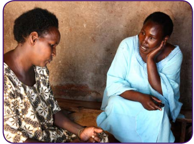
Figure 8: A community health worker (right) provides emotional support to a patient in Rwanda

CHWs can empower the community. For example, CHWs working with PIH’s sister organization in Mexico, El Equipo de Apoyo en Salud y Educación Comunitaria (EAPSEC, The Team for the Support of Community Health and Education), facilitate the process of “conscientization,” a translation of the Portuguese term “conscientização,” which is sometimes translated as “consciousness raising” or “critical consciousness.” An approach to