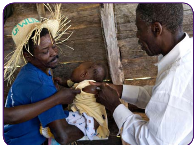
Figure 10: A community health worker in Haiti gives an infant an inoculation

A community health program that compensates its CHWs creates jobs in poor communities. However, since many governments do not feel that CHWs should be paid for their work, it is important to be prepared to discuss the benefits of fair compensation as you develop and maintain your CHW program. Compensation ensures that CHWs can dedicate a minimum number of hours per week to these tasks; this is particularly difficult in resource-limited healthcare settings if programs must rely on a pool of volunteers. Compensation can also serve