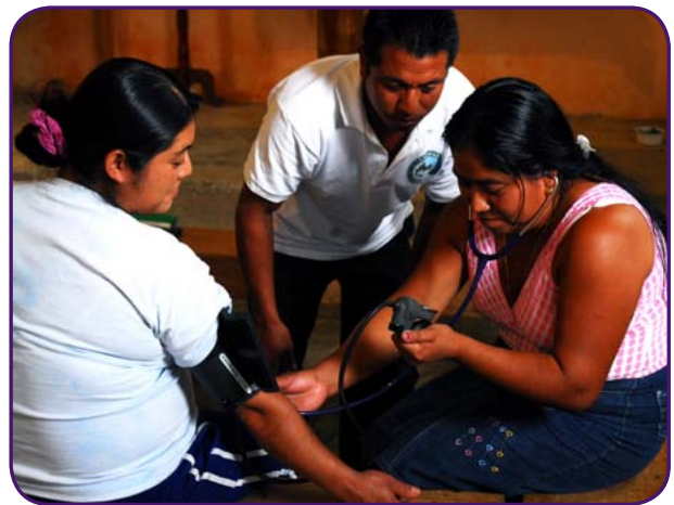
Figure 13: Health promoters practice taking blood pressure at a workshop in southern Chiapas, Mexico

Typically, CHWs are directly supervised by clinical staff, usually a doctor or nurse involved in the care of patients in the CHW’s target area. It is important to discuss supervisory responsibilities with MOH staff and other stakeholders to ensure that lines of reporting and distinct responsibilities are clear. As your program expands, CHWs who have gained knowledge and experience over time can supervise less-experienced members of the team. For example, clinical staff can choose candidates who have shown exemplary performance as CHWs, or who have demonstrated an ability to manage others. A supervisor may oversee up to 50 CHWs, so he or she should be comfortable with asserting authority and have good time-management skills. The length of time the CHW has been working and his or her level of education are also factors that can be considered when choosing supervisors.