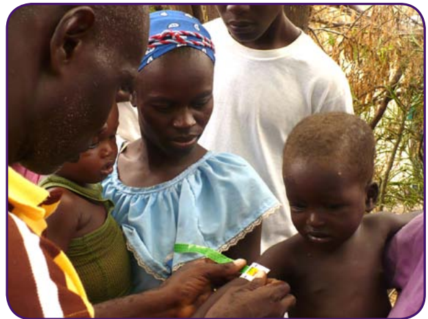
Figure 7: A community health worker in Haiti checks a child for malnutrition following Hurricane Tomas

An effective CHW program can improve coverage of many interventions known to reduce child mortality. These include, for example, management of diarrhea and acute respiratory infections, case management of pneumonia, home-based malaria treatment, management of neonatal sepsis, recognition and referral of cases of child malnutrition, and increasing uptake of vaccinations. Child survival is enhanced by the CHW's focus on preventive interventions in addition to the identification of specific diseases.