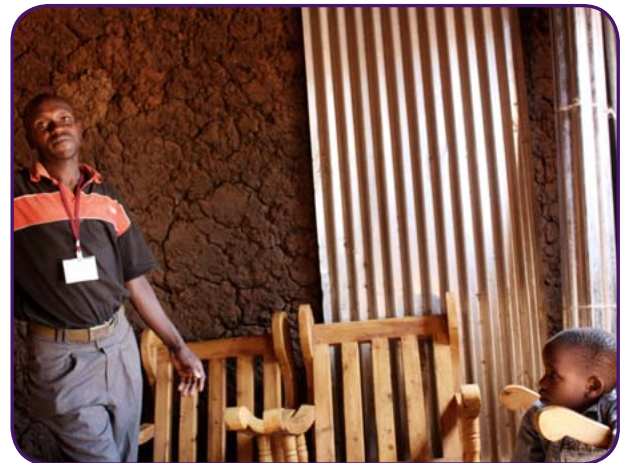
Figure 12: A community health worker in Rwanda proudly shows the new chairs he bought for his home in rural Rwanda