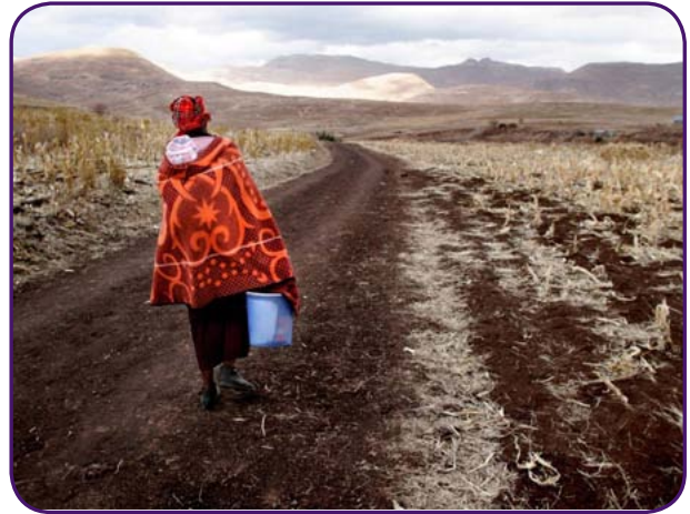
Figure 5: A village health worker in Lesotho travels long distances on foot to reach patients

CHWs are themselves from the communities they serve and, as such, are uniquely situated to build trusting relationships with patients. CHWs often share the same daily challenges as the patients they visit, and are often able to successfully present new ideas to community members, such as the importance of prenatal care, or accessing treatment for malaria or childhood malnutrition. These shared experiences can foster a trusting relationship more quickly and may facilitate successful referral for medical or socioeconomic services. In addition, CHWs can deliver medications to patients' homes, provide directly observed therapy, offer first-aid (such as preventing significant bleeding) prior to obtaining the necessary urgent professional care patients may need, and visit households to conduct active case finding. They can also provide training and support for health interventions that do not require a facility (such as training and supervision in the provision of oral rehydration therapy [ORT]). CHWs can significantly reduce barriers in access to care by facilitating transportation, arranging for childcare, and reducing patients' fear of discrimination at the clinic and in the community.