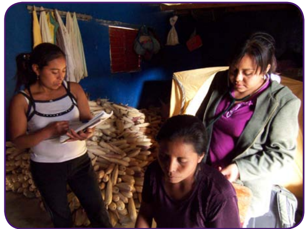
Figure 9: A community health worker (left) and physician visit a patient’s home in the mountainous Chiapas region of Mexico