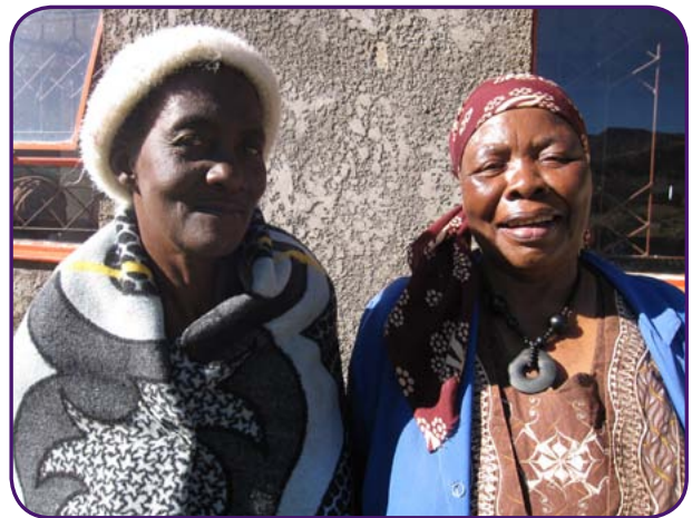
Figure 16: The two oldest village health workers in Nohana, Lesotho

Depending on the scope of your CHW program, supervision may include ensuring that CHWs visit community members regularly in order to monitor general health and well-being, referring appropriately, and administering medications correctly. The CHW supervisor will review the forms that CHWs complete to ensure that they are filled out correctly, and will conduct routine or surprise home visits in order to verify reported information and address any questions or concerns that may have arisen. Additionally, supervisors must identify topics for further training and communicate this to relevant individuals, helping to arrange, plan, and implement formal classroom training or informal mentoring as needed. Furthermore, supervisors must ensure that lines of communication remain open between the health center staff and CHWs, meeting regularly to address relevant concerns and collaboratively develop solutions. Finally, CHW supervisors are responsible for orienting new CHWs to their work. Supervisors are, in many ways, accompagnateurs to the CHWs, offering them guidance, support, and clear expectations, modeling the attitudes and support by which CHWs will accompany community members to improve their health and well-being.