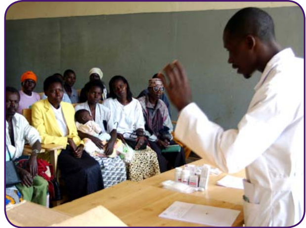
Figure 2: A nurse in Rwinkwavu, Rwanda speaks to patients and to their CHWs about HIV treatment regimens

clinical team members may foster acceptance of the crucial role CHWs can play in clinical care. In some instances, physicians consult with patients in the presence of the patient's CHW. For example, at the PIH-supported sites in Rwanda, a CHW is on duty during clinic hours to accompany any patient who might need or request this service. Following an initial meeting, holding monthly team meetings with all employees will encourage ongoing communication about programmatic and clinical issues. Trainings with physicians and nurses should also include sections on the importance of collaboration with CHWs. Consider having clinicians meet CHWs during CHW trainings, give them a tour of the hospital, and introduce them to other clinical staff.