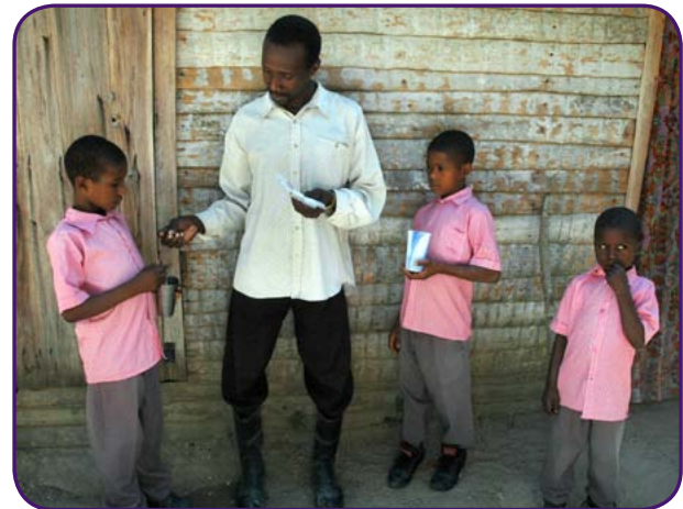
Figure 6: A community health worker distributes medicines to patients in rural Haiti